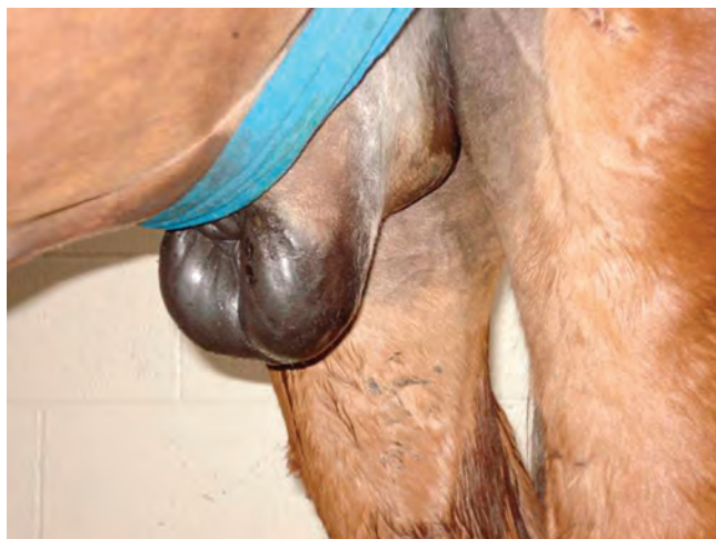
Fig. 1. Horse with excessive post-operative swelling and edema after castration.

by establishing drainage and administering non-steroidal anti-inflammatory drugs (NSAIDs). The horse is sedated, the area is aseptically prepared, and the incision is manually opened and stretched using sterile gloves. It is imperative that the owner follow this treatment up by instituting daily (or twice daily) exercise to prevent premature closure of the incision. If left untreated, excessive swelling can lead to the development of paraphimosis, surgical site infection, and dysuria.