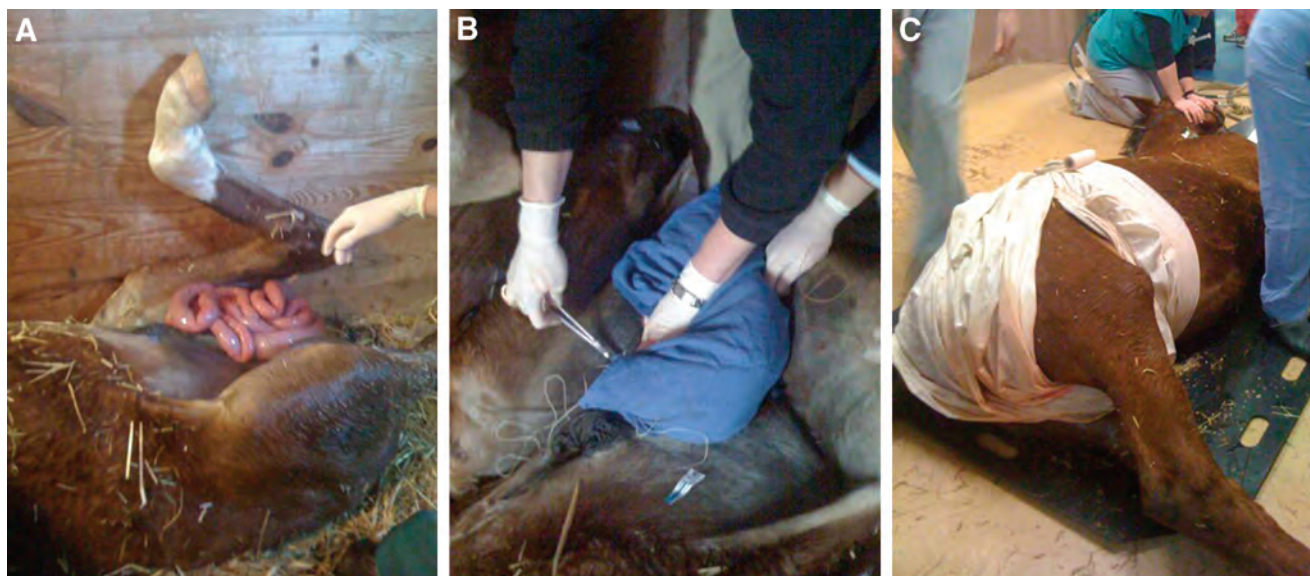
Fig. 3. (A) A yearling that developed small intestinal eventration 4 h after a routine closed castration. Because of the large amount of intestine eventrated, it was not possible to replace it into the scrotum. (B) Therefore, a hand towel was sutured to the skin to form a sling. (C) This was covered with a sheet for additional support during transport to the referral center.

late as 12 days after surgery. 4-7 Risk factors include breed (Standardbreds and Draft Horses are over-represented breeds, and anecdotally, Saddlebreds and Tennessee Walking Horses are also at increased risk), pre-existing inguinal hernias, presence of an inguinal hernia as a foal, and an internal inguinal ring that 2 or more fingers can fit into on rectal palpation. In these cases, it is recommended that a closed or modified open castration with a ligature placed around the cord be performed. A closed castration without a ligature will not decrease the risk of eventration, but the addition of a ligature has been shown to decrease the risk.